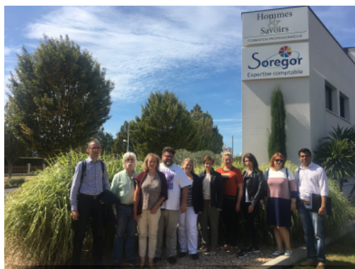
Hommes & Savoirs (FR) was the host organization

In addition, representatives of partner organizations discussed the produced Specification of the Curriculum and Course Syllabus for the Office ECO Consultant Training System. Timetable, milestones and deadlines were also reviewed.